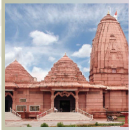
ISKCON Temple Surat